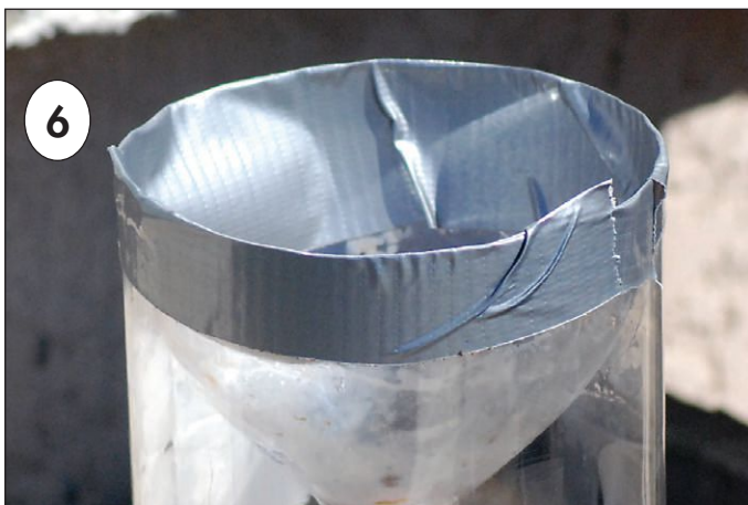
6 Continue to tape the seams of the top with the duct tape.