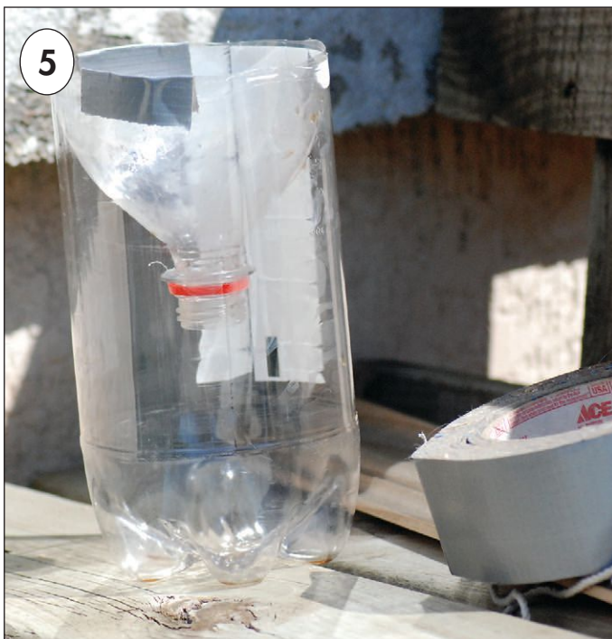
5 Secure the inverted top, now made into a "funnel" to the base of the bottle with duct tape.

When the traps are full, remove them and dispose of them properly. Replace the traps as needed. A two-liter bottle will hold a great number of pests that would otherwise be tormenting the livestock. It takes only a few minutes to make a trap. RH