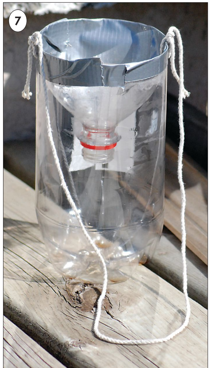
7 With the Exacto® knife or a leather hole punch, make a hole on each side of the bottle and thread a piece of string or wire long enough to hang the trap.